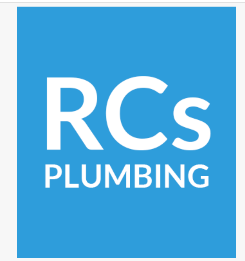
RC Plumbing Logo

That's why it's important you consider changing out your faucets and shower heads to more water-efficient models. They come in every style, size, and price range, and they often function better using far less water than the old-style equipment you've probably been using for years.