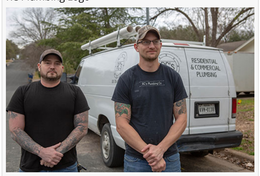
RC Plumbing in Austin

In gardens and other planting areas, RC's Plumbing Company can install drip irrigation systems