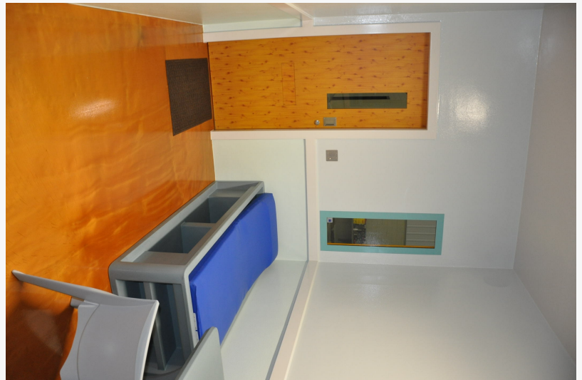
Mental Health Unit