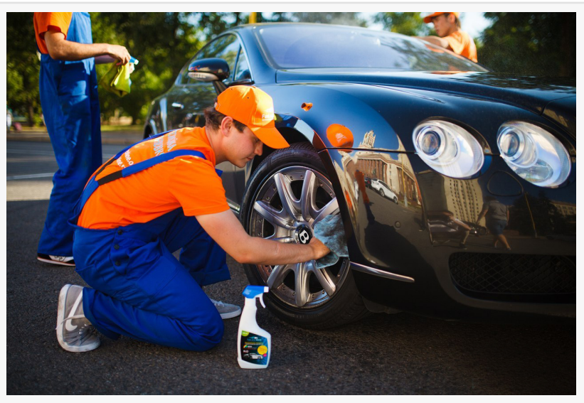
Fast Shine Car Wash Process

"We have main offices in three cities: New York, Limassol, and Moscow, in other cities and countries we run on a