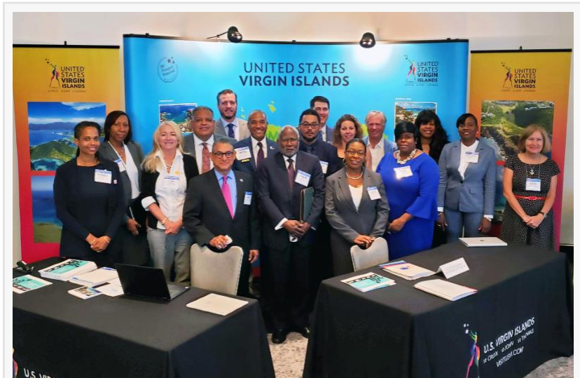
The USVI public and private sector delegation at CHRIS