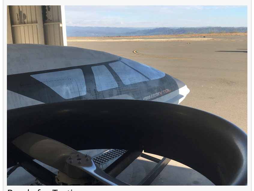
Ready for Testing