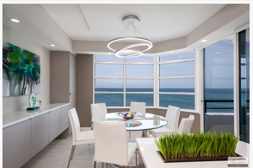
*"Design Magazine" photo of Beach Condo Full Gut and Remodel

NCR reports that customers are excited about their new custom home, large remodel or home addition project and at the same time are terrified that their project will fall short of their expectations.