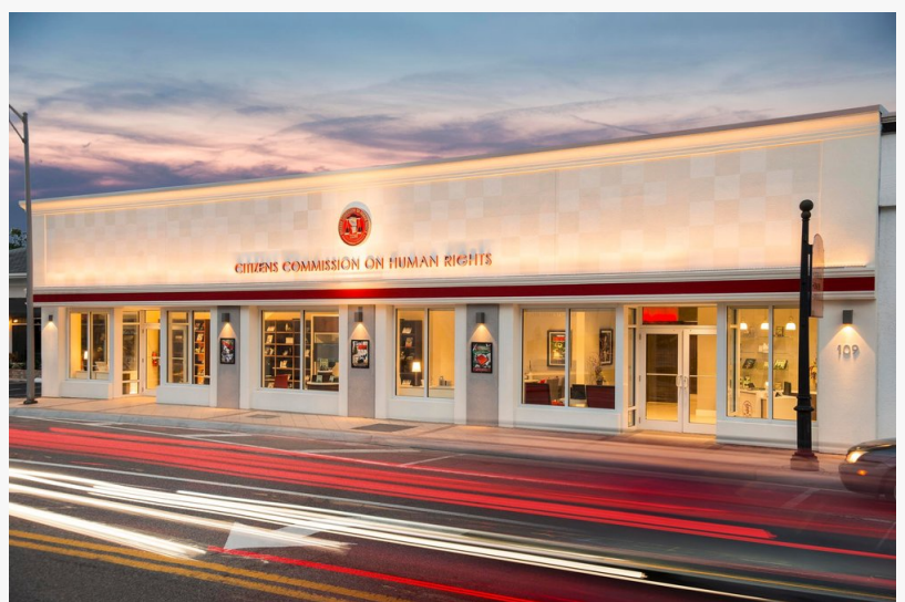
The headquarters for CCHR Florida are located in downtown Clearwater.

The study is yet another blow to the psychiatric profession, which for decades has struggled in vain to find any physical basis for mental disorders, prompting the Citizens Commission on Human Rights (CCHR) to implore lawmakers to strengthen the informed consent laws in the United States.