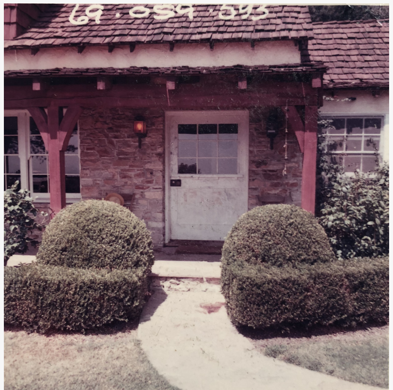
10050 Cielo Drive where Sharon Tate was brutally murdered

The book will be launched simultaneously in nine countries: