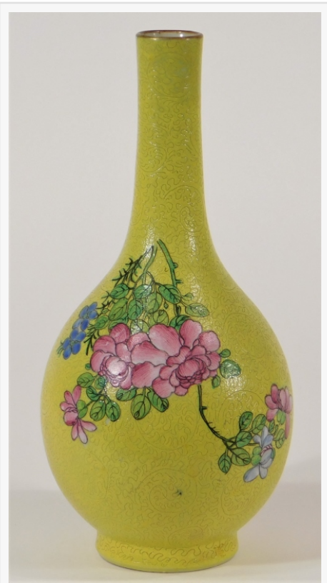
Chinese Republic Period Sgraffito bottle form vase, 8 \frac{3}{4} inches tall, yellow enameled ground with an incised foliate pattern decorated with pink chrysanthemum flowers (est. $600-$900).

This press release can be viewed online at: http://www.einpresswire.com