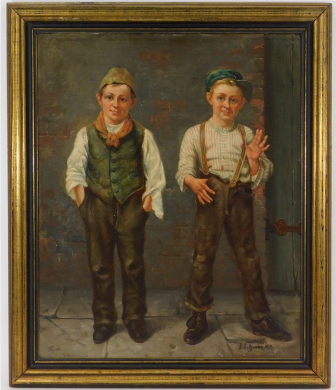
Realistic genre painting by John George Brown (N.Y./Calif., 1831-1913), of two young boys standing on a cobblestone sidewalk against a wall near a green painted door (est. $5,000-$8,000).