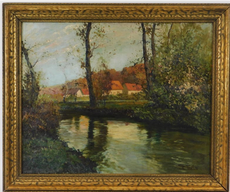
Reflective Impressionist painting by Frits Thaulow (1847-1906), signed lower right, depicting a tranquil river with forest embankments and a cluster of farm buildings (est. $6,000-$9,000).

depicts a tranquil river with forest embankments and a cluster of farm buildings. Thaulow was a mentor to famous artist Edvard Munch (1863-1944).