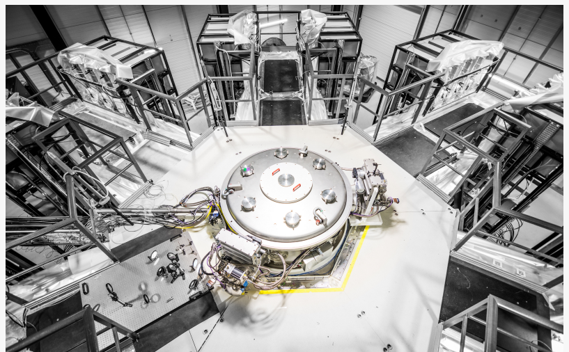
Vacuum chamber in which the firing takes place