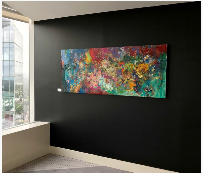
Kerry Hallam, Dancing Toes, acrylic on canvas over wood panel, 30 x 72 inches