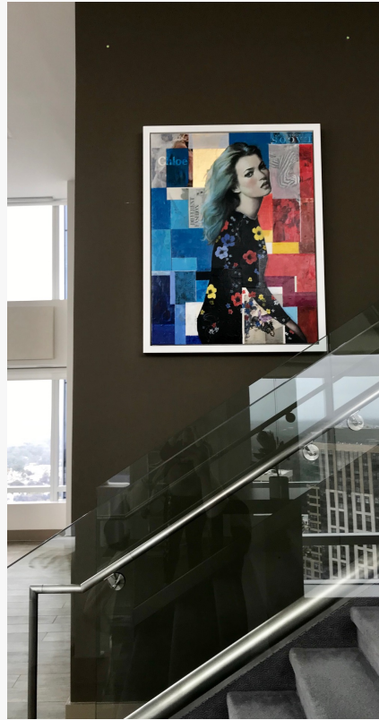
François Fressiner, K8 Moss, oil and mixed media on canvas, 50 x 38 inches