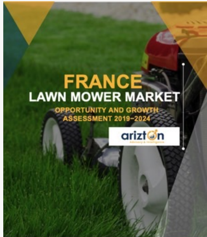
France Lawnmower market 2024