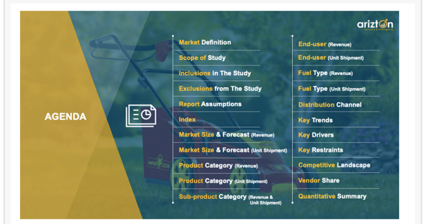
France lawn mower market snapshot 2024