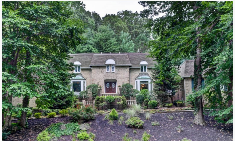
Holmdel Auction 2019 - Home Front