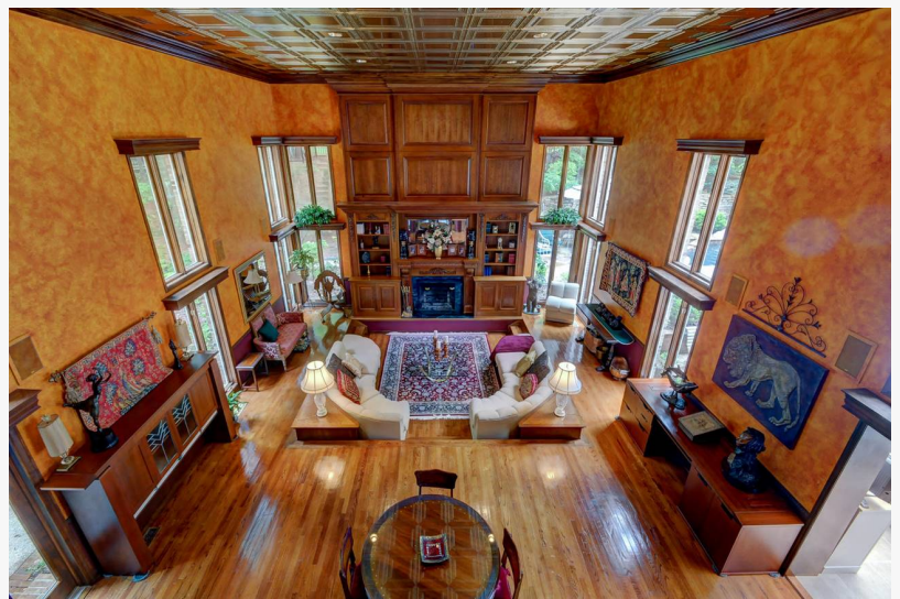
Holmdel Auction 2019 - Great Room