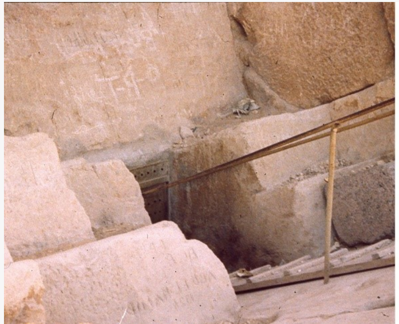
Original entrance to the Great Pyramid

Expecting great treasure, Al Mamoun and his band poured boiling vinegar on the limestone to soften it, then slowly chipped away at the softened blocks. They started about twenty feet up from the base, selecting a spot about that was seventy feet from the original hidden entrance. It is important to note that they made the passage large enough to walk upright, which is common sense. The original entrance requires stooping over and walking down a steep and potentially