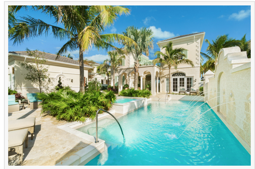
Villa at The Shore Club Turks and Caicos

Exceptional Villas is a European based vacation Rental Company with clients and destinations all over the world. They have been in the travel business for over 25 years and offer a bespoke service to their clients. This service includes matching the perfect villa to each of their clients and also providing full and complimentary concierge service. This service includes organizing all aspects of the client's vacations such as VIP airport arrival, ground transportation, restaurant reservations, tours and excursions, water sports and pre-arrival stocking. Unlike some of their competitors, they