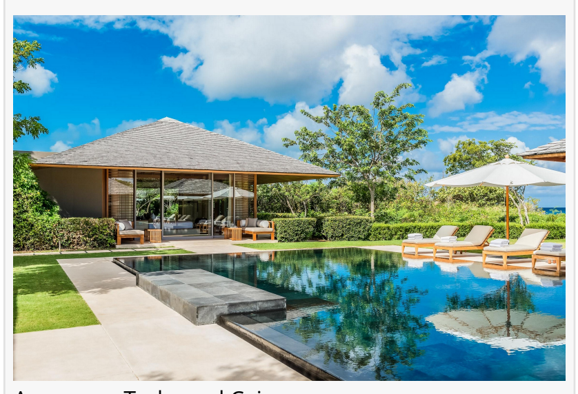
Amanyara Turks and Caicos

which has been regularly voted as the number one beach in the world for several years in a row.