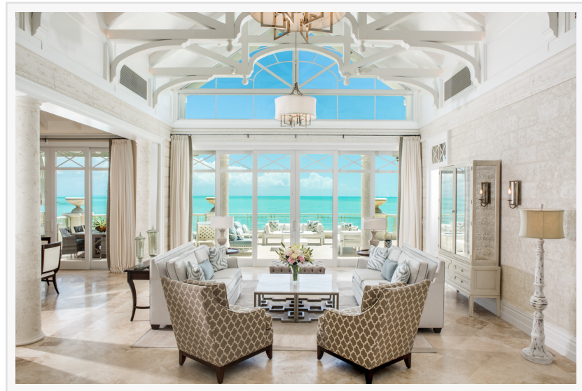
The Shore Club Turks and Caicos

There are 40 islands in total, all of which are low lying. The main gateway from a tourism point of view is Providenciales, which is also where most of the luxury resorts and villa rentals have their location. The island of Providenciales, called Provo locally is most famous for Grace Bay Beach