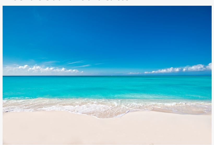
Worlds Best Beach Turks and Caicos