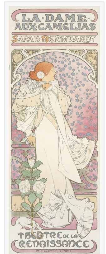
The exquisite La Dame aux Camélias (1896), by Alphonse Mucha (1860-1939), 29 5/8 inches by 82 1/4 inches (est. $25,000-$30,000).