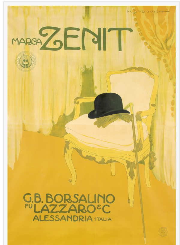
Marcello Dudovich's (1878-1962) theatrical still life, Marca Zenit / G. B. Borsalino (1911), 53 1/2 inches by 78 inches (est. $15,000-$20,000).

Public viewings will be held daily from June 7th through the 22nd. For more information, visit www.posterauctions.com or www.rennertsgallery.com . Or, you may call the gallery at (212) 787-4000. The 200-page, full-color catalog is available for $40. You may call or visit our website to order a copy.