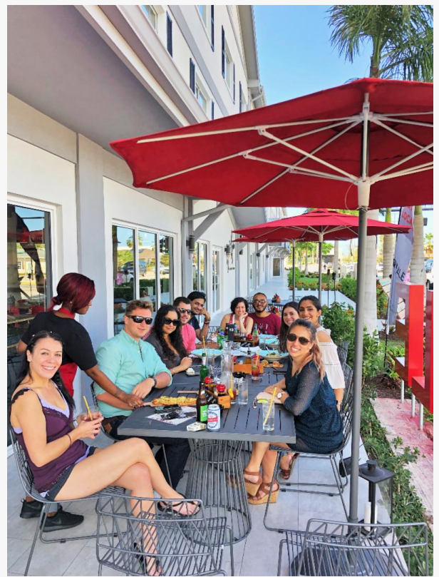
Bonfire offers delicious food and cool vibes.

Greta Andzenge Marketplace Excellence +1 201-861-2056 email us here