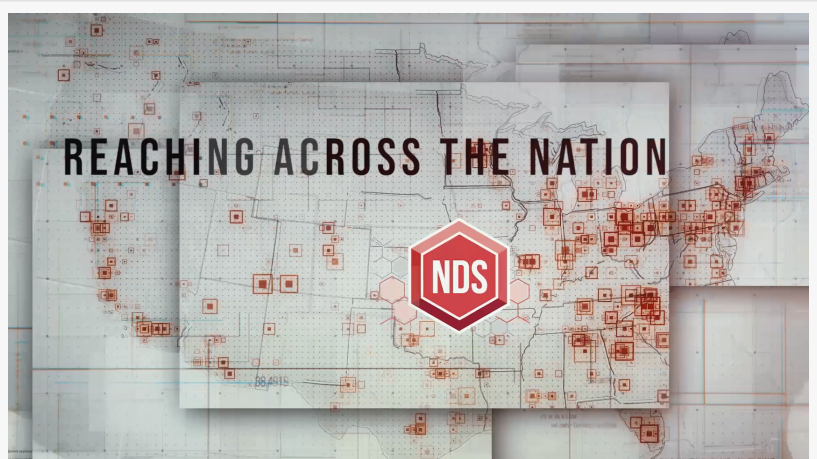
National Drug Screening offers Nationwide testing