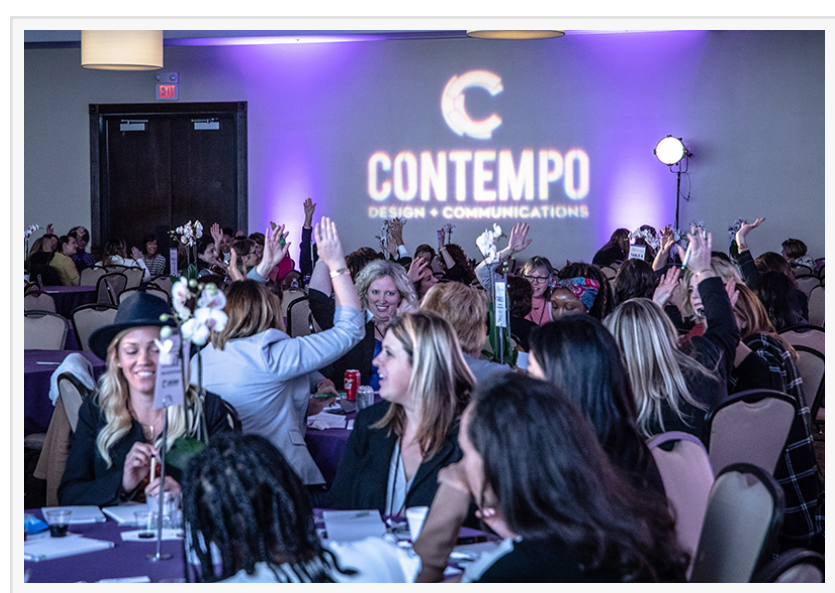
Intentional Networking, FES 2018

CLEVELAND, OHIO, U.S., June 7, 2019 /EINPresswire.com/ -- Contempo Design + Communications, founder and producer of the annual Female Entrepreneur Summit (FES), has announced a stellar list of speakers for its eighth annual day devoted to the female entrepreneur. FES is Cleveland's signature event for female business leaders to connect, learn, and grow, and will take place on October 23rd at the Cleveland History Center. More than 25 successful industry professionals will share opportunities