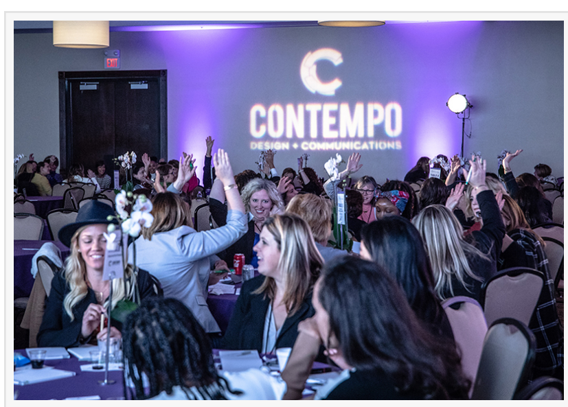
Intentional Networking, FES 2018

CLEVELAND, OHIO, U.S., June 7, 2019 /EINPresswire.com/ -- Contempo Design + Communications, founder and producer of the annual Female Entrepreneur Summit (FES), has announced a stellar list of speakers for its eighth annual day devoted to the female entrepreneur. FES is Cleveland's signature event for female business leaders to connect, learn, and grow, and will take place on October 23rd at the Cleveland History Center. More than 25 successful industry professionals will share opportunities