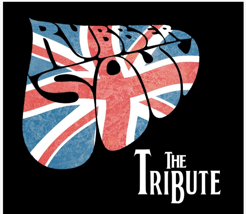
Rubber Soul: A Beatles Tribute