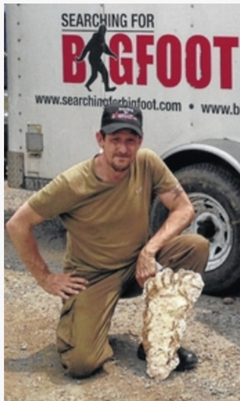
Cast of Large Print