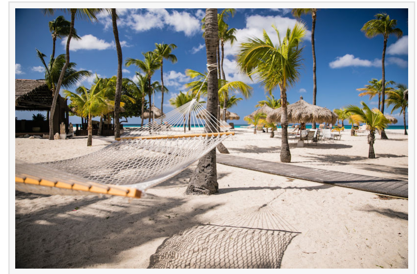
Manchebo Beach Resort & Spa

The resort is strongly committed to environmental and social sustainability principles. Last year, several initiatives were implemented to minimize the resort's environmental impact including reducing and recycling plastics.