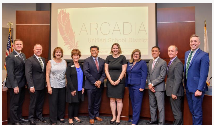
Arcadia Unified School District (AUSD)

Business Week named Arcadia as the “best place to raise your kids” in the entire state of California on two separate occasions. With various professional development opportunities, conferences, staff development workshops, collaboration time, and learning walks, the Arcadia Unified faculty stays ahead of the curve to ensure a rigorous, vertically aligned curriculum that fully prepares students for college and career. In 2015, the district began hosting the Arcadia Innovation Summit, one of the premiere educational conferences in the country that is free of charge.