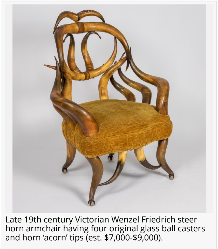
Late 19th century Victorian Wenzel Friedrich steer horn armchair having four original glass ball casters and horn 'acorn' tips (est. $7,000-$9,000).

Serena Harragin Gray's Auctioneers & Appraisers + 1 216-226-3300 email us here