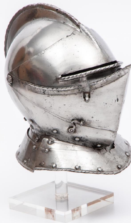
Circa 1560 English close helmet made in the Greenwich, England workshop established by King Henry VIII (est. $5,000-$7,000).