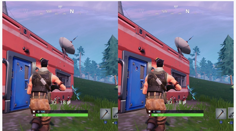
Before and After Using mClassic on Fortnite

mClassic's patented technology redraws every single pixel on the fly at 120 FPS with near-zero latency and eliminates jagged edges that are smoothed over by our advanced anti-aliasing algorithm. While graphics video processors typically focus on either the "sharpness" or "naturalness" of an image, mClassic ensures the image is in perfect balance. In fact, the original mCable was so "game-changing" that the legendary Technicolor® certified the technology used in mClassic to meet the rigorous standards of Technicolor's 4K Image Certified test suite. mClassic also supports HDMI High Definition Audio for a full range of high definition audio types including DSD, DTS-HD Master Audio, and Dolby Atmos. The sleek, portable mClassic stick weighs less than an ounce, measures 0.8in x 1.6in x 2.2in and features Marseille's VTV-1224 chip, 4K Chroma 4:4:4 Scaler Processor, HDMI 1.4b Receiver/Transmitter and 120 FPS Graphic Post-Processor. It also features three function selection modes: Pass-Thru, Full-Processing, and Retro Game Mode.