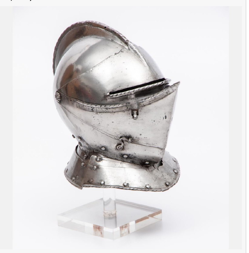
Circa 1560 English close helmet made in the Greenwich, England workshop established by King Henry VIII (est. $5,000-$7,000).

Oil on canvas View of the Delaware River by American artist Samuel George Phillips (1890-1965), signed lower right and 20 inches by 24 inches (est. $5,000-$7,000).