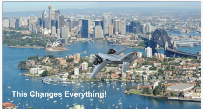
TriFan 600 is Coming to Australia!