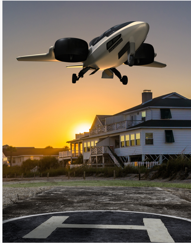
No Need for a Runway