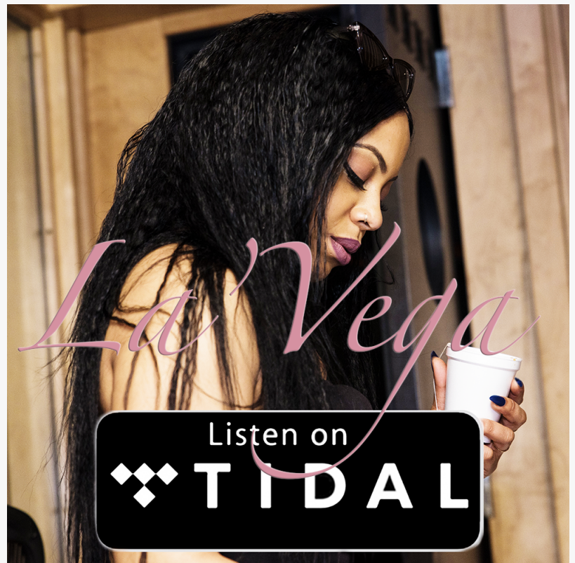
Hip Hop Artist La'Vega on Tidal

This press release can be viewed online at: http://www.einpresswire.com