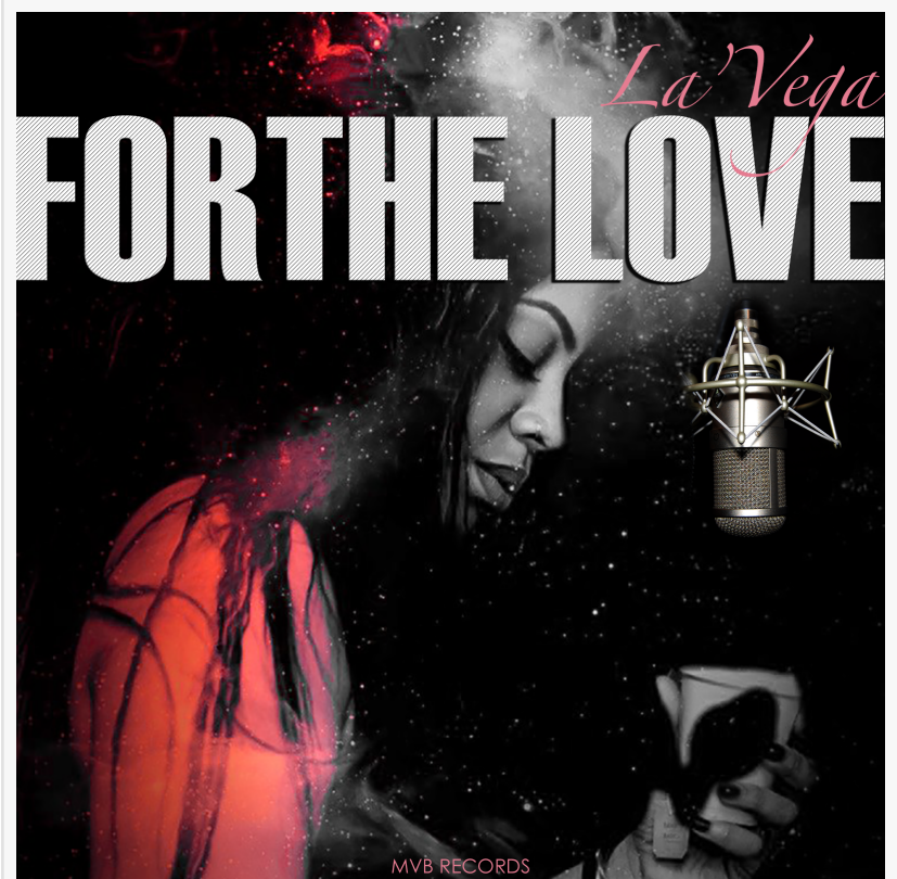
For The Love cover artwork

The highlights of the mixtape are the last four tracks; 3. No Bay-Bee , 4. Get It Poppin', 5. Bigger The Bag, and 6. Like a Boss (Boss Lil Man). The standout track on the mixtape has to be "No Bay-Bee". "No Bay-Bee" shows off La'Vega's melody making skills and her unmatched ability to write killer hooks. The hook on "No Bay-Bee" is so infectious that it is sure to have it's listeners throwing up their middle fingers to every hater in their lives. It is rumored that "No Bay-Bee" is supposed to be remixed with a featured artist, but no official word has been released to confirm