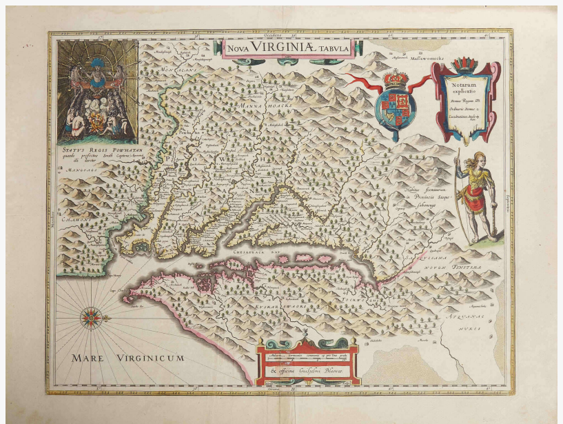
Hand-colored copper engraving by Willem Janszoon Blaeu (1571-1638), titled Nova Virginia Tabula , 17 ½ inches by 22 ½ inches, with Native American vignettes (est. $1,000-$2,000).