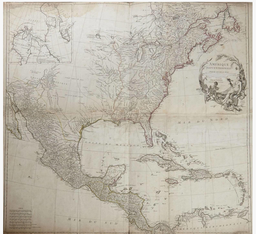
Map of North America, Mexico, the Caribbean by Jean Baptiste D'Anville (1699-1782), titled Amerique Septentrionales (1746), 33 inches by 35 ½ inches (est. $800-$1,200).