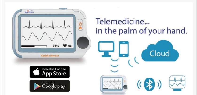
Connect via Bluetooth to IOS or Android Devices with Free App