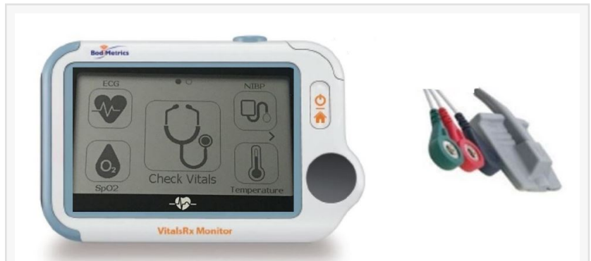
Capture Spot Vitals and Continuous ECG / SpO2