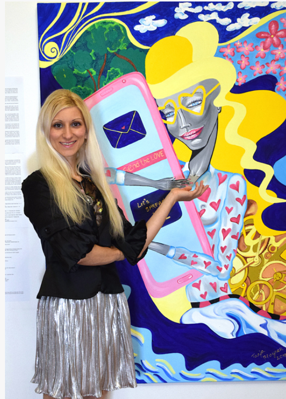
wellknown Pop Art Artist Tanja Playner