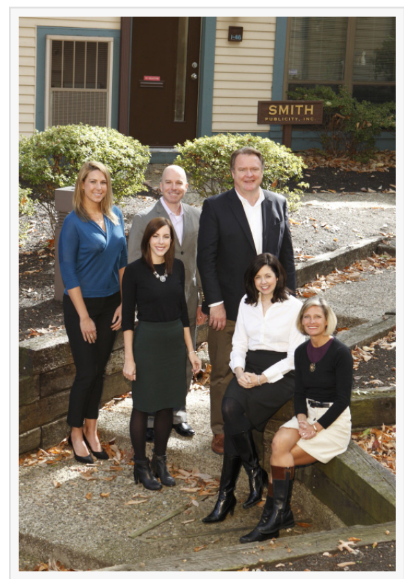
Smith Publicity Executive Team

Contrary to what you might think, media outlets often become interested in an author or book when a producer or editor hears or reads about it from another media outlet! Why do you see authors become "hot" media items, heavily requested for interviews? Because once media professionals are no different than anyone else. If they hear about someone interesting, they are going to be interested. With the exception of "hard news," i.e. breaking, explosive stories, media outlets consistently cover the same subjects and people.