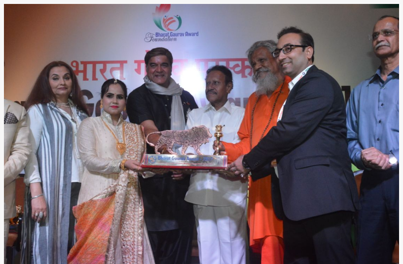
Best Indian Literary Award