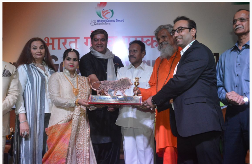
Best Indian Literary Award