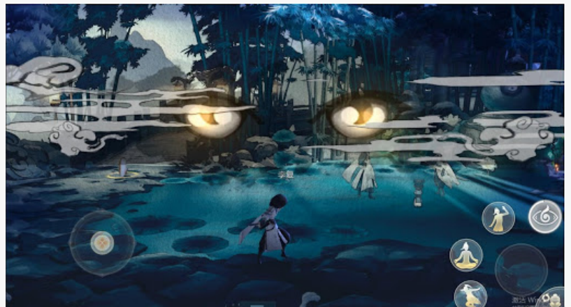
Eastward Legend: The Empyrean