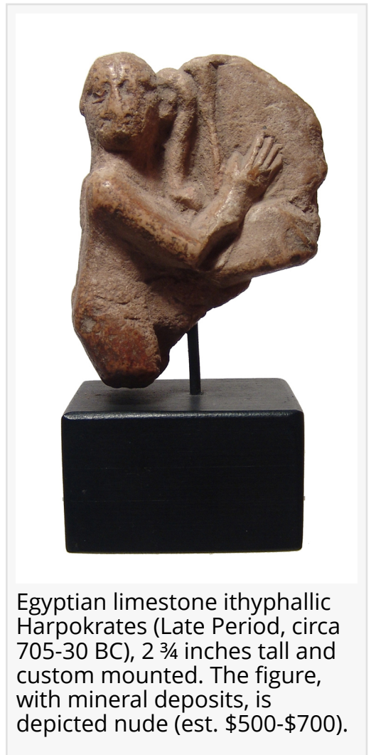
Egyptian limestone ithyphallic Harpokrates (Late Period, circa 705-30 BC), 2 ¾ inches tall and custom mounted. The figure, with mineral deposits, is depicted nude (est. $500-$700).

Ancient Resource Auctions is one of the few specialized auction houses that makes genuine ancient artifacts available to its worldwide client base at reasonable prices. “We are a small operation with a passion and dedication for ancient history,” Gabriel Vandervort commented.