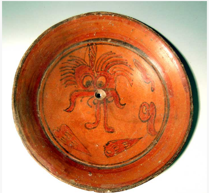
Maya polychrome plate from Guatemala (circa 600-900 AD) is 12 ¾ inches in diameter, professionally restored from five pieces, with no new material added (est. 900-$1,200).