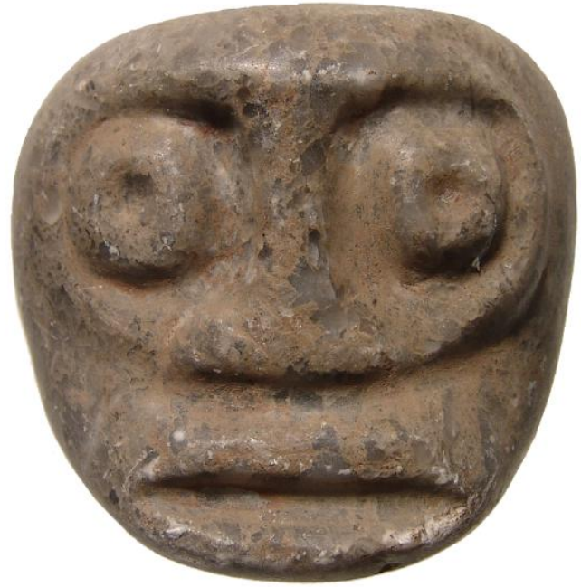
Costa Rican greenstone mace in the form of a human head (Guanacaste-Nicoya, circa 100-500 AD), with bulging eyes, wide nose and a narrow-slit mouth (est. $500-$700).