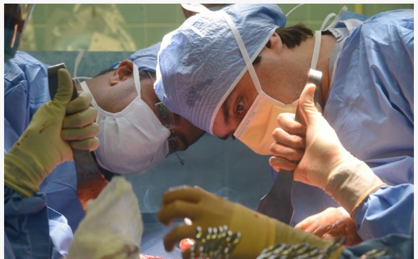
Dr Tansar Mir operating on a patient in a publicized case

If you are one of the many people struggling with your sagging skin and want a boost to your physical appearance, you can opt for a rhytidectomy procedure. The results generally last up to ten years.