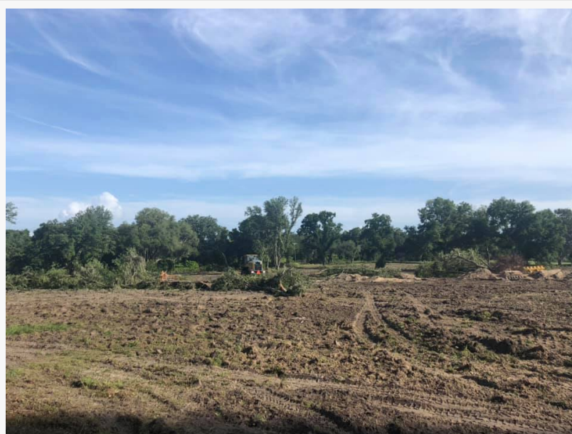
Wildwood RV Village - Construction Has Begun!

Owners Mandy Alonso and Mike Wood are also buying another 20 acres across from the Wildwood RV Village Campground and plan to build a 800 bay storage facility to accomodate RV's , Cargo Trailers and Boats. Not only will this accomodate the lack of RV Storage in the area, but will also include a free service inspection to