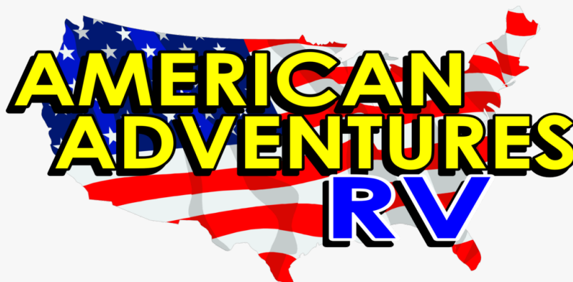
American Adventures RV