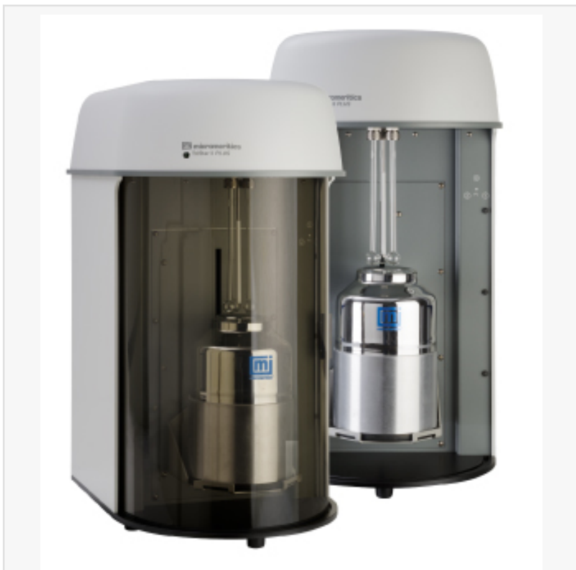
Micromeritics TriStar II Plus is an automated, three-station, surface area and porosity analyzer that delivers excellent performance and speed of analysis

Micromeritics Instrument Corporation is a global provider of solutions for material characterization with best-in-class instrumentation and application expertise in five core areas: density; surface area and porosity; particle size and shape; powder characterization; and catalyst characterization and process development. Founded in 1962, the company has its headquarters in Norcross, Georgia, USA and more than 300 employees worldwide. With a fully integrated operation that extends from a world class scientific knowledge base through to in-house manufacture, Micromeritics delivers an extensive range of high-performance products for academic research and industrial problem-solving. Micromeritics' customer-centric approach is