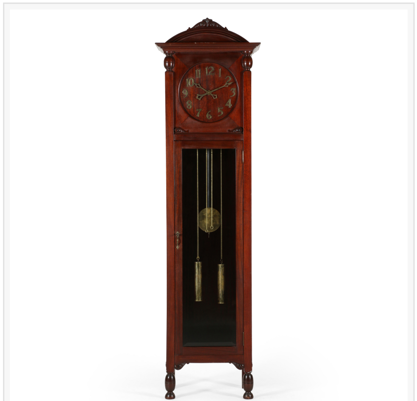
Rare Pequegnat "Nelson" tall case clock, one of only a few known, 81 inches in height, with mahogany case, a beveled glass door and correct "twin dolphins" door key (CA$8,625).

The auction was held online and in Miller & Miller's gallery located at 59 Webster Street in New Hamburg, Ontario. It was actually a two-day, two-session affair, held June 7th-8th, featuring over 700 lots of collector-grade art, clocks, fountain pens, lamps, art glass and objects of historical interest from world-class makers. June 7th was dedicated solely to rare, collectible fountain pens.