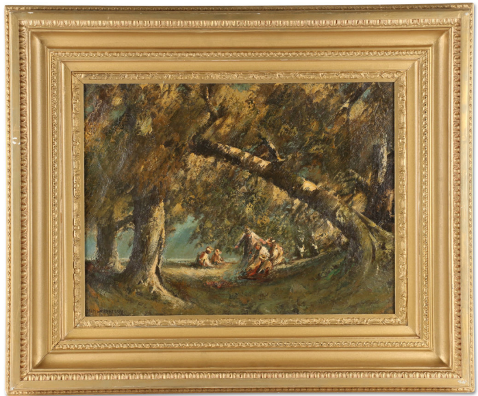
Oil on canvas painting by Homer Ransford Watson (Canadian, 1855-1936), depicting a forest scene with a group of subjects gathered in a clearing, signed "Homer Watson (CA$8,625).