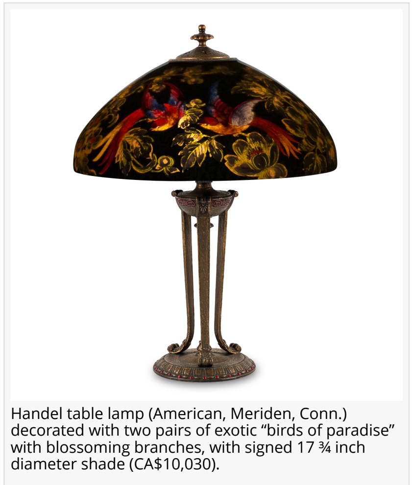
Handel table lamp (American, Meriden, Conn.) decorated with two pairs of exotic “birds of paradise” with blossoming branches, with signed 17 ¾ inch diameter shade (CA$10,030).

Miller & Miller Auctions Ltd. is a seller of high-value collections between $200,000 and $3 million. Individual items of merit are always considered. It is Canada’s #1 trusted place for collectors to buy and sell. The firm is always accepting quality merchandise for future auctions.