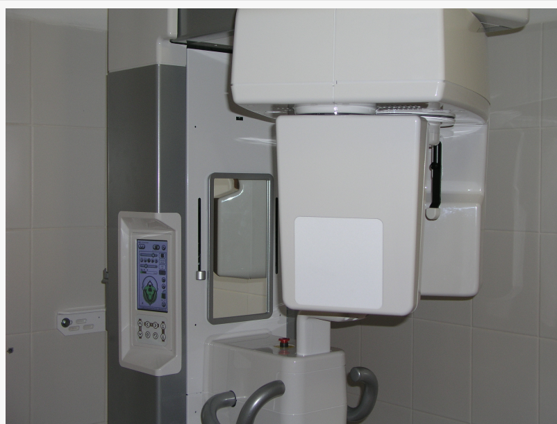
CBCT unit with screen

dental restoration it is inevitable to make a 3D CBCT scan for a careful planning. This scan visualizes the temporo-mandibular joints (the fix part of the skull and the lower jaw) and the upper and lower jaws and gives the possibility to make measurements and 3D plans. A mock-up based on the plan shows the final aesthetic result for the patient to help them to make decision. The pre-treatment checkups give the answer for the question whether there are any risks of the implantation or the treatment is contraindicated.