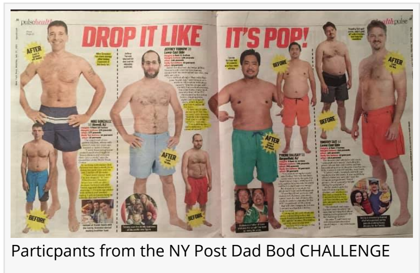
Participants from the NY Post Dad Bod CHALLENGE

COLUMBUS, OHIO, UNITED STATES, June 18, 2019 /EINPresswire.com/ -- The infamous Dad Bod, many media sources are saying more women are finding the Dad bod more appealing than ever before. Studies show visceral fat can lead to all sorts of health problems including heart disease, diabetes, and cancer. That should be enough information to say no to the Dad Bod. Try the 60 Day Bod Challenge.