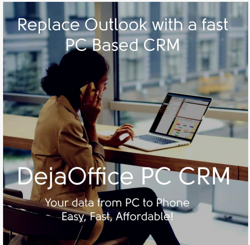
Replace Outlook with a fast Personal CRM