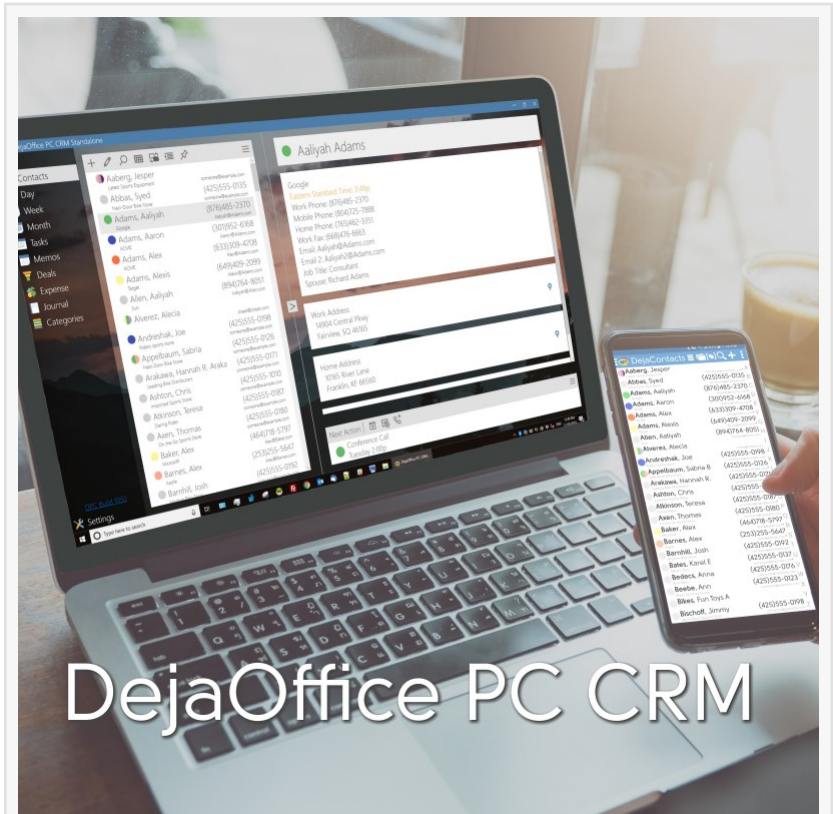
DejaOffice Personal CRM for Windows, Android and iPhone