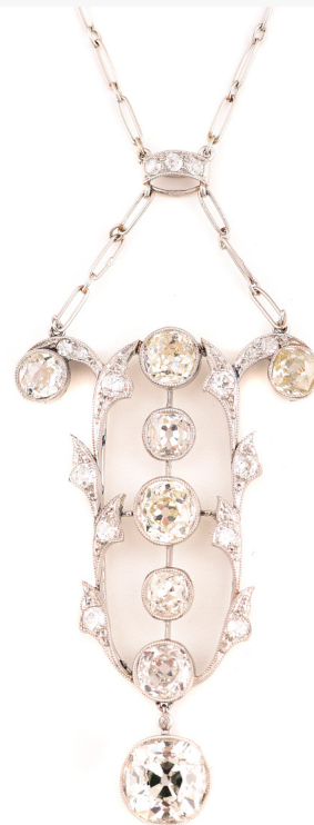
Diamond Necklace 2