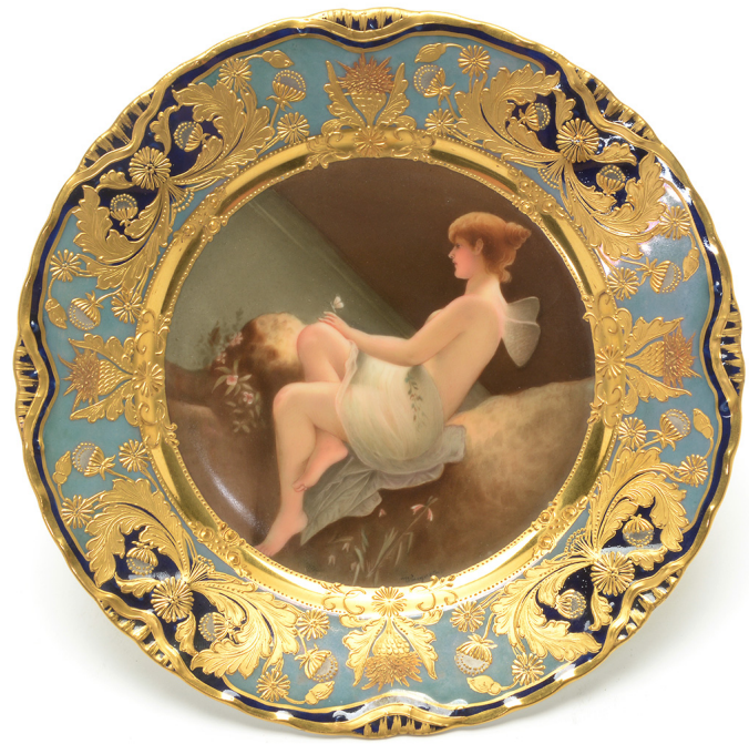
Custom Plate Antique