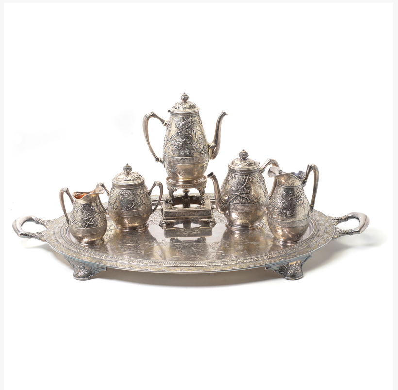
Antique Tea Set

This press release can be viewed online at: http://www.einpresswire.com