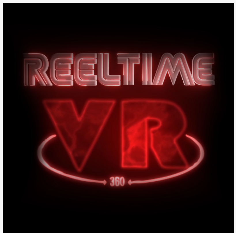
ReelTime VR Red

VR shows such as ReelTime VRs No. 1 award-winning Virtual Reality travel series “In Front of View” starring international superstar Front Montgomery and her daughter Leonie Montgomery,