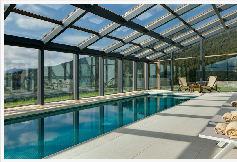
The indoor pool of Grand Forest, Metsovo, Greece

The private land ranges in 2 square kilometers and is located on the footsteps of Pindus National Park, also