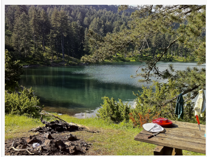
The beauty of the surroundings

known as Valia Kalda, and is probably the least known and least visited of any National Park in all of Europe. It was established in 1966 and considered one of the most important protected areas for the maintenance of mountainous biodiversity. The National Park is characterized by extensive forests of black pine and beech in the park's lower and middle altitudes and Balkan pine at higher altitudes. The area hosts a population of Eurasian brown bears, which is a conservation priority species.