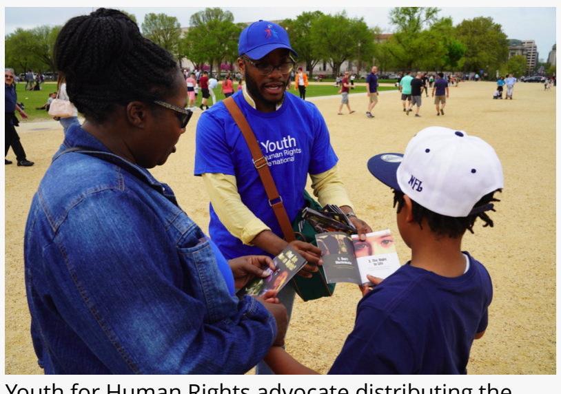
Youth for Human Rights advocate distributing the "What Are Human Rights?" booklets to parents and children

This press release can be viewed online at: http://www.einpresswire.com