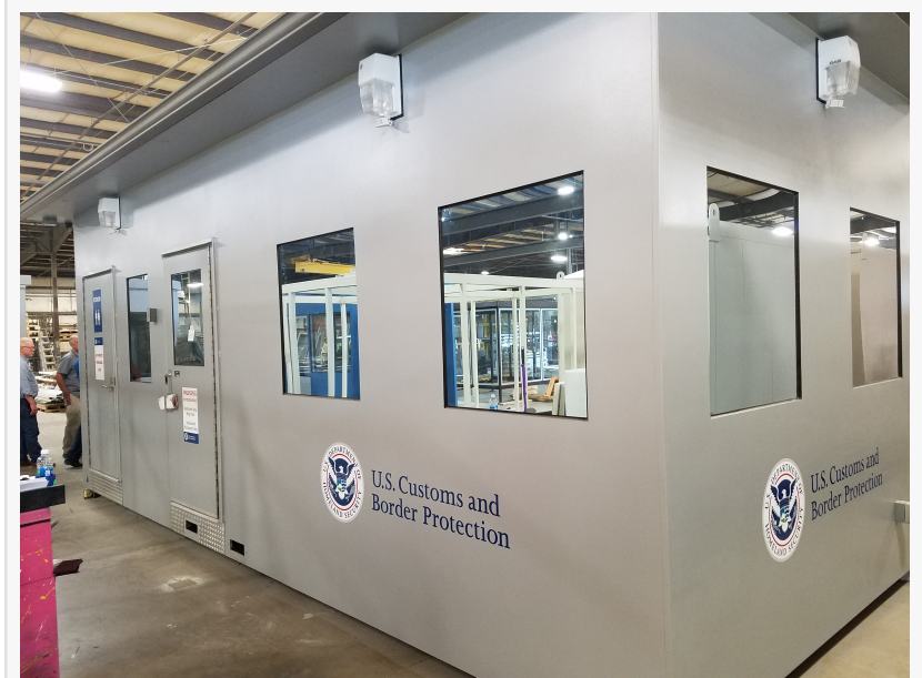
Bulletproof guard inspection station