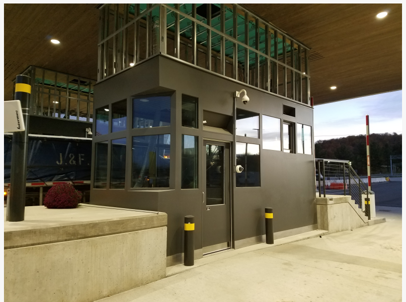
Installation of a Border Security Modular Prefab Booth